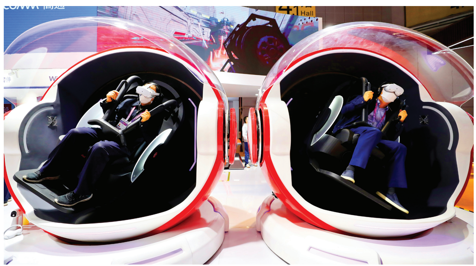
Visitors try gaming capsules in the booth of US company Qualcomm at the fifth China International Import Expo.