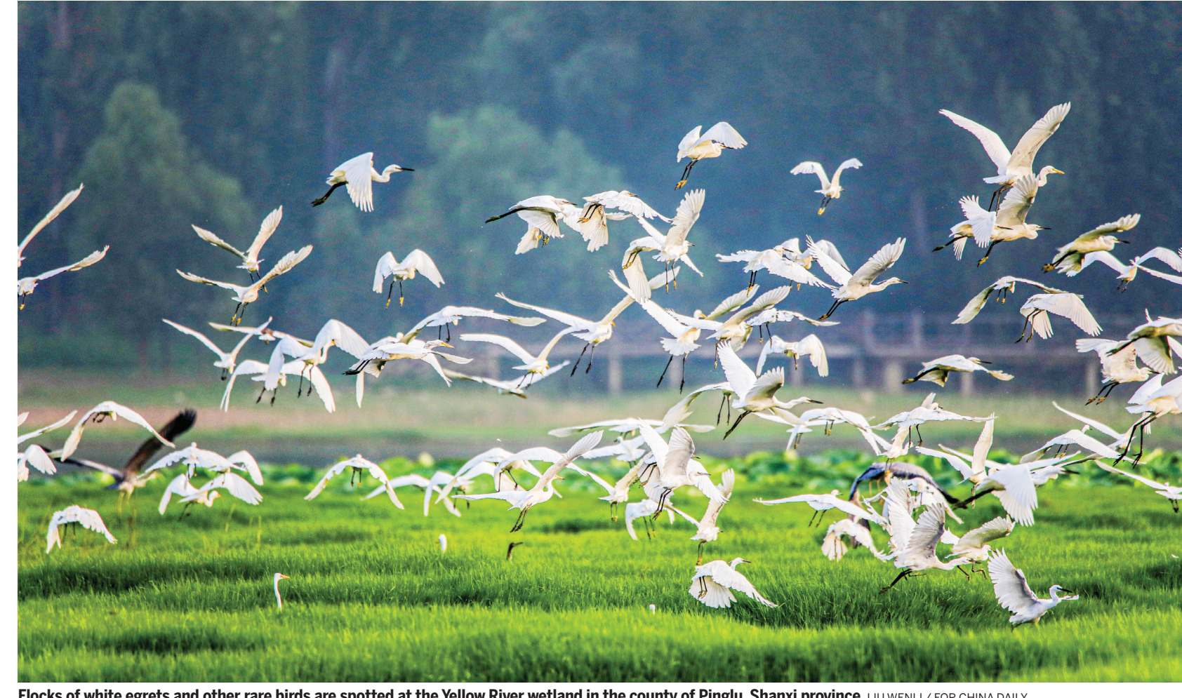
Flocks of white egrets and other rare birds are spotted at the Yellow River wetland in the county of Pinglu, Shanxi province.