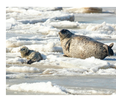
Spotted seals sunbathe on the floating ice in Liaodong Bay off the coast of Dalian, Liaoning province.

In January 2002 a patch of the reserve was named as a wetland of international importance under the Ramsar Convention on Wetlands.